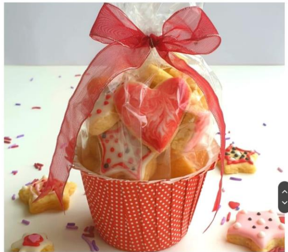
CUTE CUP R30