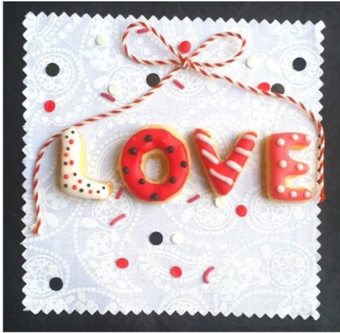
LOVE TEXT R15