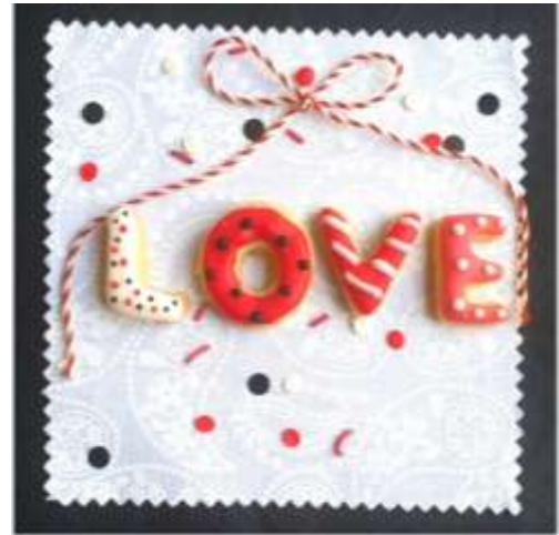
LOVE TEXT R15