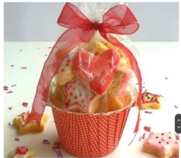
CUTE CUP R30